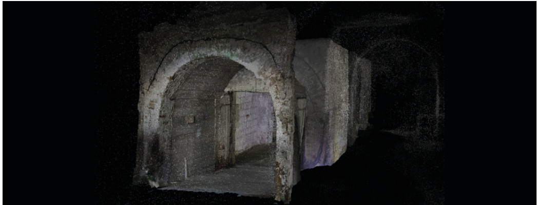
Fig. 1. Point cloud of the cave.

chronized mode, both the video stream, to 4 ultra-short-throw video projectors, and the spatialized audio stream with 5 independent channels, to the respective 4 active acoustic speakers and the subwoofer.